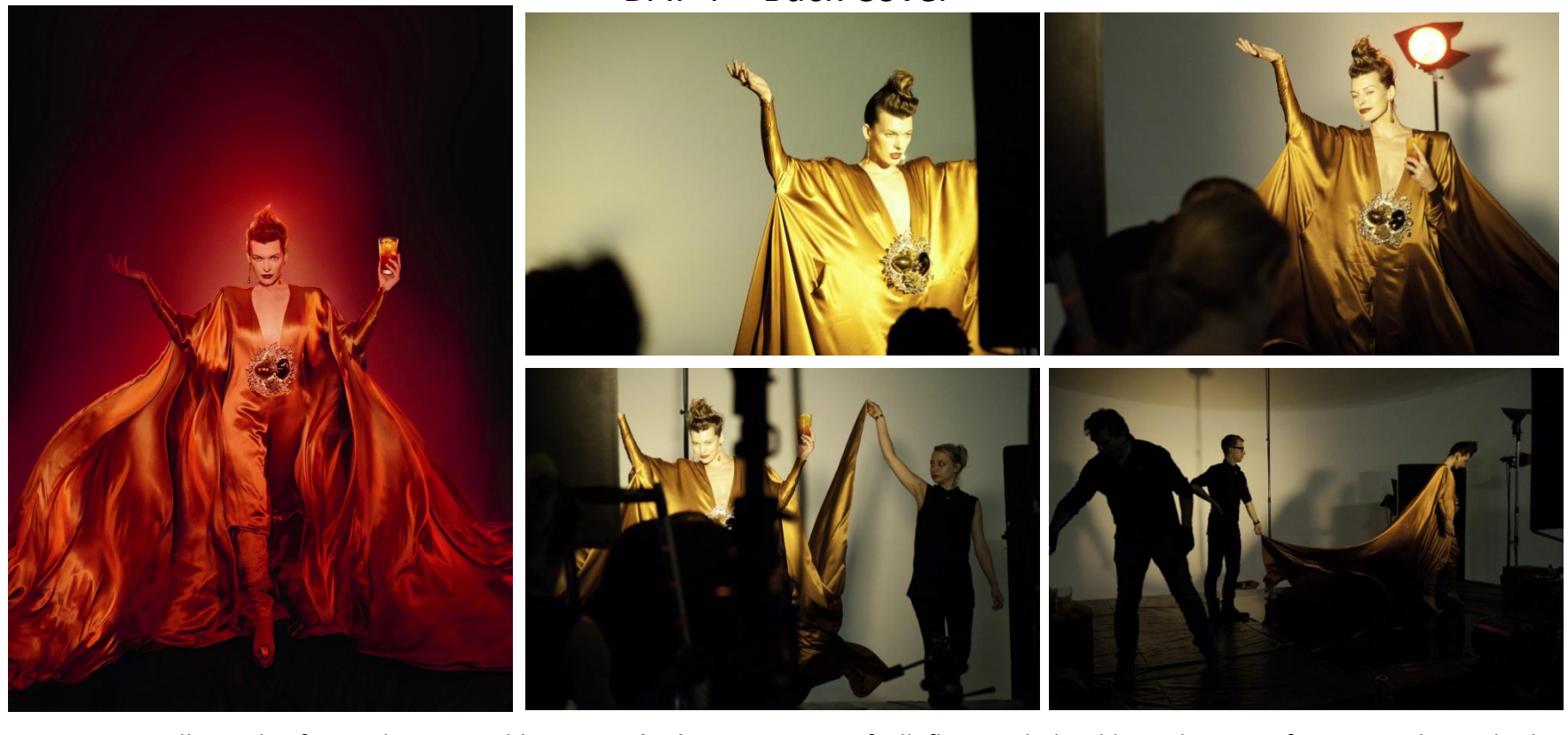
DAY 4 – Back Cover

A majestic Milla strides forward unstoppably as scorched orange strips of silk flare up behind her. There are firestorms that nobody can put out.